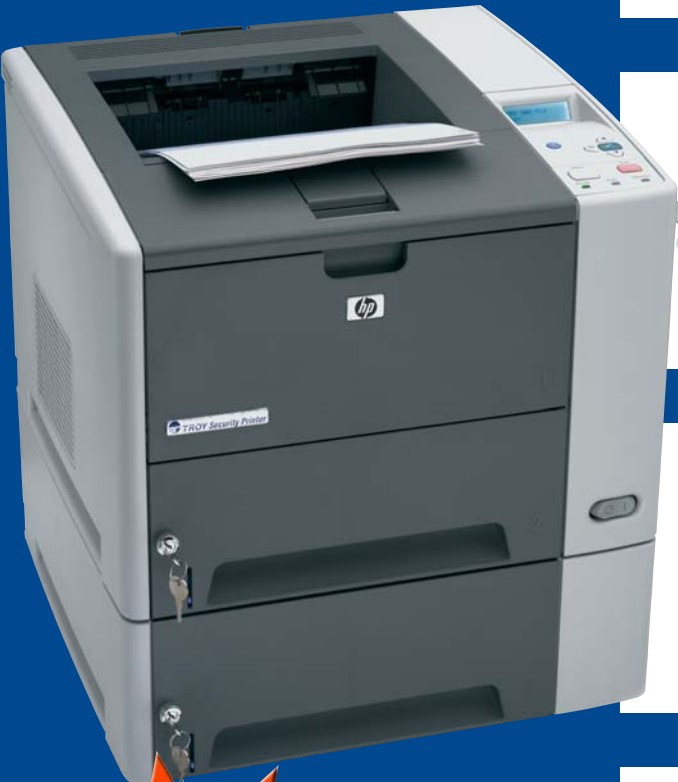
TROY MICR 3005 Secure Ex printer shown with optional 2nd 500-sheet tray.

Featuring TROY MICR Toner Secure a patented solution for product details visit www.Troygroup.com/MICRTonerSecure