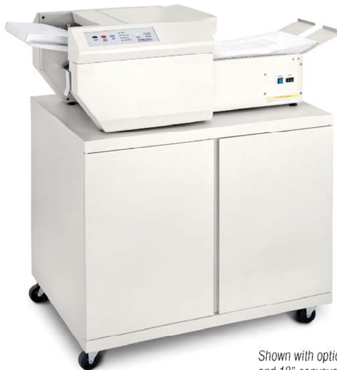
Shown with optional cabinet and 18" conveyor

16 Kingston Road, Unit #8 • Exeter, NH 03833