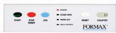
User friendly control panel

The FD 2000 processes forms at a rate of up to 7,000 sheets per hour and can hold up to 150 - 24# forms in the feed hopper. Combined with a duty cycle of up to 25,000 forms per month, the FD 2000 offers an economical and reliable solution for departmental post processing.